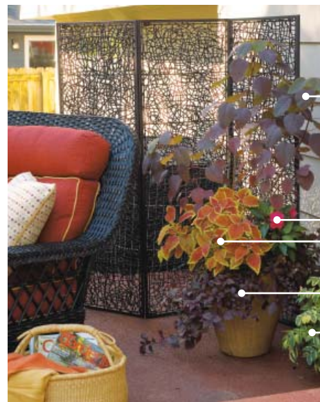
Burgundy-leaved spurge New Guinea impatiens Coleus Bloodleaf Jacob's ladder