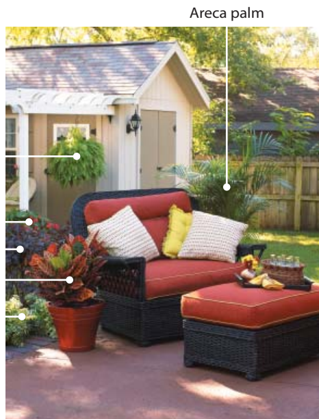
Boston fern Dragon Wing™ begonia Ninebark Croton Jacob's ladder